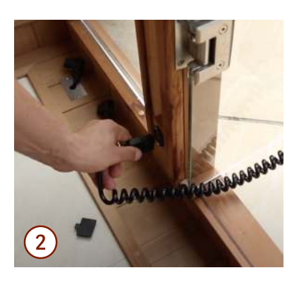
Connect your Clearlight® FS Mini Heater to the additional heater plug, located inside your sauna, on the right hand side near your glass sauna door.