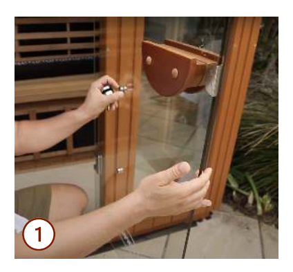
Remove the existing metal plugs on your Clearlight<sup>®</sup> sauna glass door to reveal two holes.