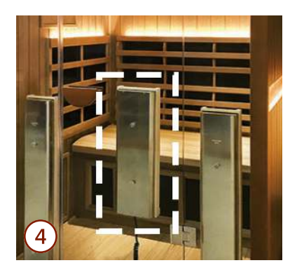
Insert & gently tighten the screws from the outside of the sauna to fasten the Clearlight® FS Mini Heater to the glass sauna door.