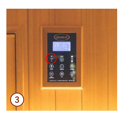
Using the TEMP buttons, ensure your Clearlight<sup>®</sup> Sauna is set to 60° Celsius.