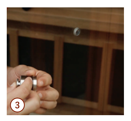
Holding the Clearlight® FS Mini Heater in place on the inside of the sauna, align the holes in the glass sauna door with the holes on the back of your Clearlight® FS Mini Heater.