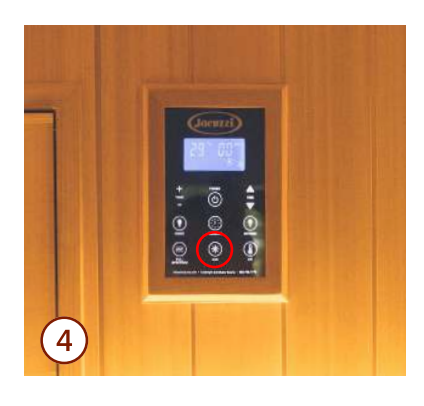
Hold down the AUX button immediately for 5 seconds before the temperature reverts and changes temperature display. You will hear a faint beeping sound. The heater should now light up red.