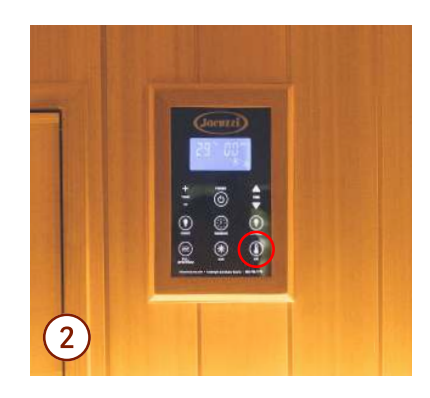
Turn your temperature display settings to Celsius by pressing the F/C temperature display button, changing it from Fahrenheit to Celsius.