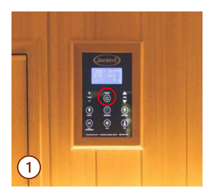
Turn on your Clearlight<sup>®</sup> Sauna by touching the Power button on your keypad.

This activation step requires a set of keypad commands, and once activated your Clearlight® FS Mini Heater bulbs will instantly light up.